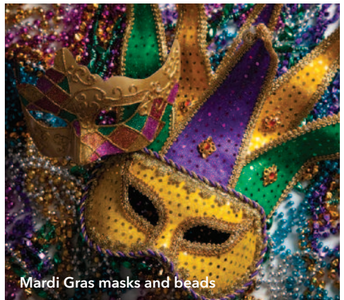
Mardi Gras masks and beads

This is the place to eat, drink, listen to jazz or R&B, and immerse yourself in the atmosphere. A visit to this unique destination is never the same trip twice, but always memorable. Sugar-dusted beignets are a must, and the street musicians will have you dancing on the sidewalk.