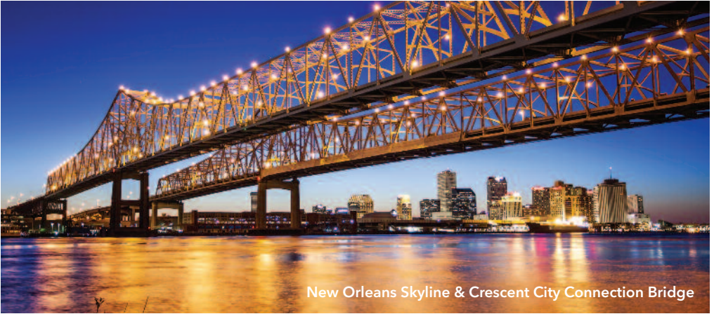
New Orleans Skyline & Crescent City Connection Bridge

New Orleans is a small city brimming with a rich culture. Its music, unique food, traditions, and history, are known all over the world. Come and experience for yourself what makes New Orleans a place to enjoy and celebrate life.