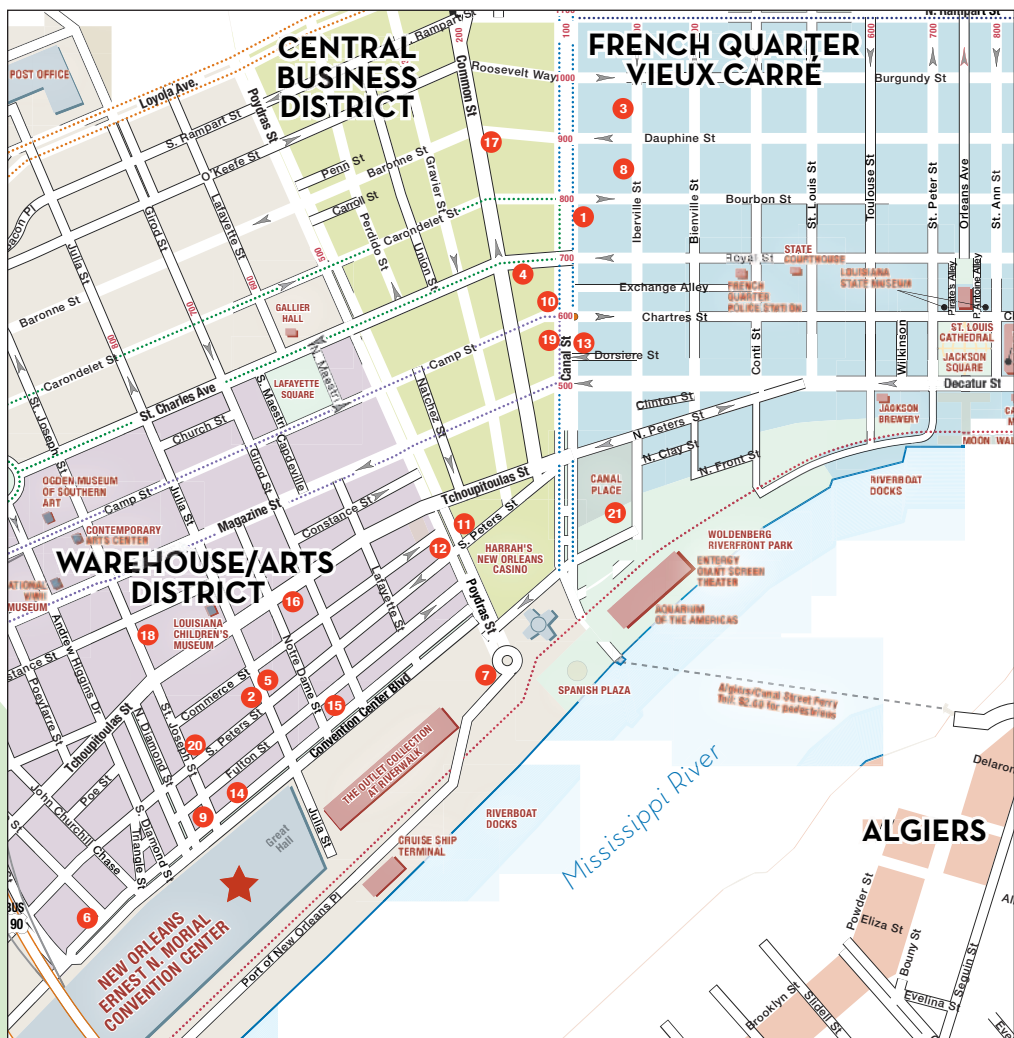
Ernest N. Morial Convention Center